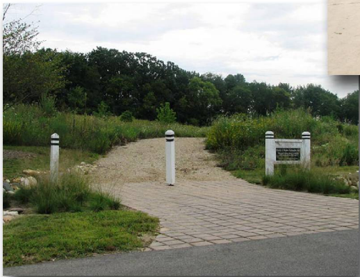
EXAMPLE OF MINOR TRAILHEAD