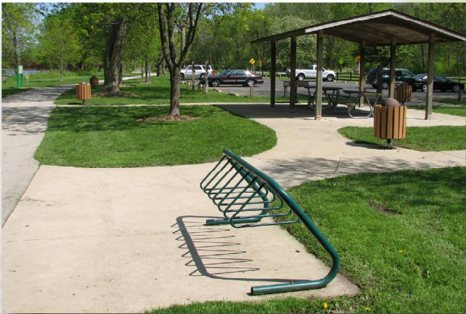
EXAMPLE OF MAJOR TRAILHEAD