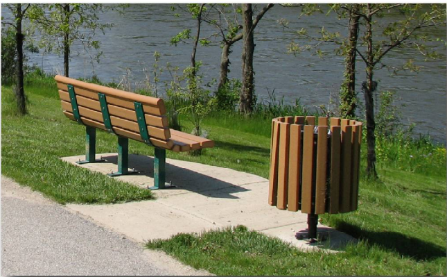
TYPICAL RESTING AREA

A Trailhead is a specified area for public access located at the beginning of a trail or periodically along a trail. These areas will typically provide a range of services for trail users depending on the trailhead's location. A MAJOR TRAILHEAD is typically located along a roadway corridor and in a situation where vehicular access is available to the amenity. These facilities will typically offer the most services to trail users (vehicular parking, restrooms, benches, bike racks, etc...). A MINOR TRAILHEAD is typically used as a starting/stopping point and will offer limited amenities (for example: benches, trash receptacles, and drinking fountains, etc...).