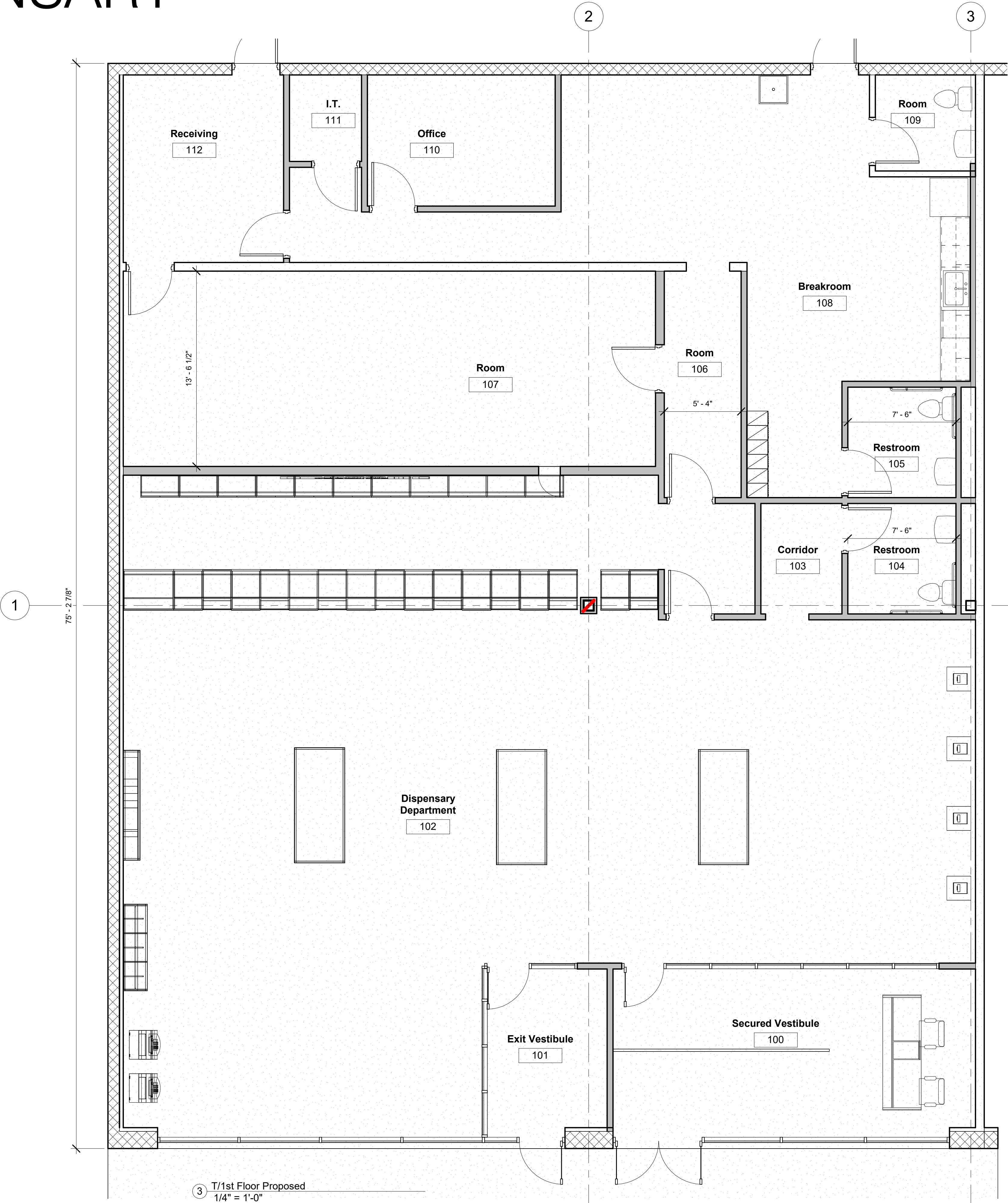
3 T/1st Floor Proposed 1/4" = 1'-0"

ARCHITECT: J Stanulis Architects 10 North Roslyn Road Westmont, IL 60559 Ph: 773.203.4544 jeremy@jstanulis.com