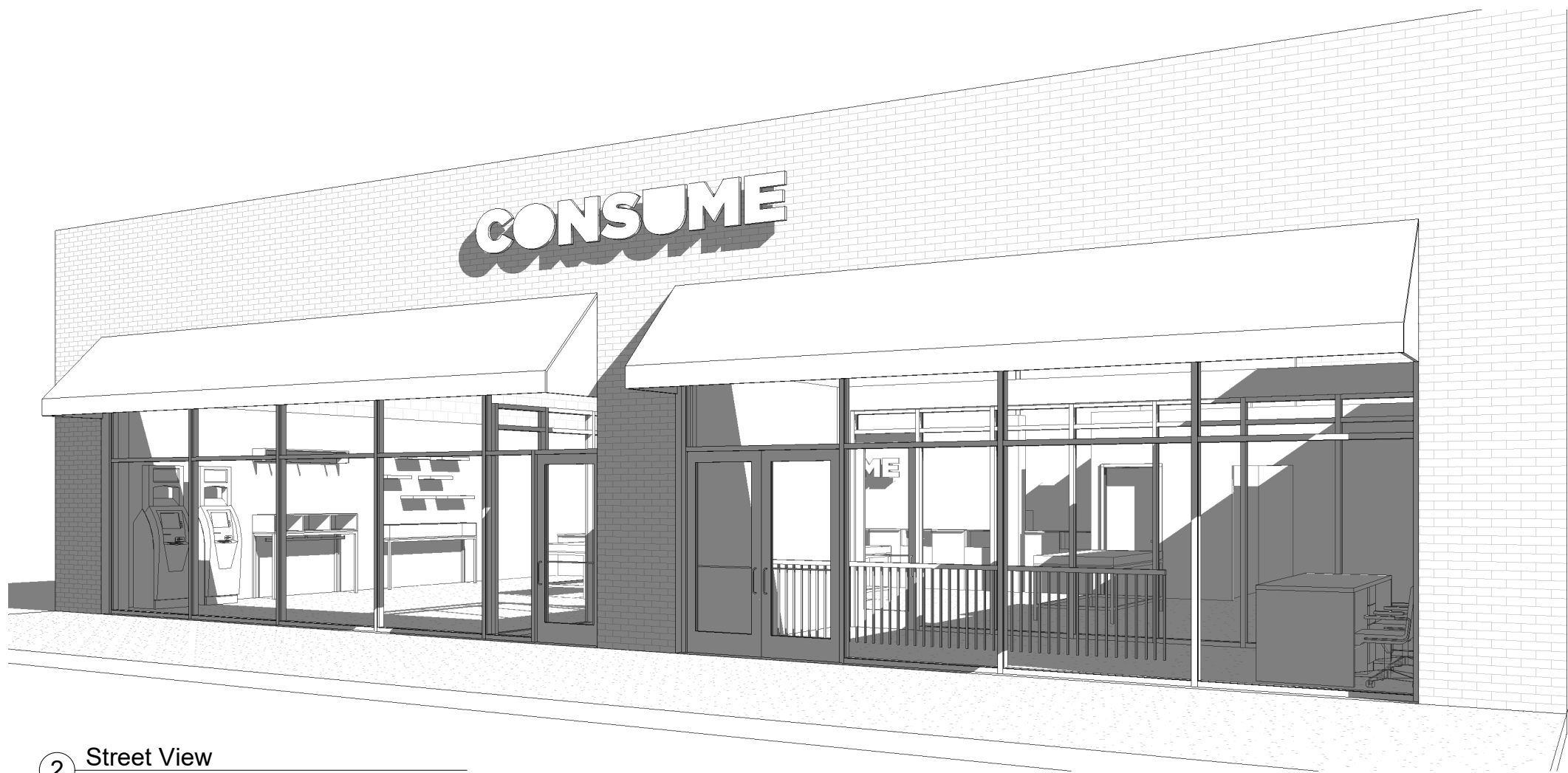
2 Street View

YORKVILLE MARKETPLANCE 344 EAST VETERANS PARKWAY YORKVILLE, IL