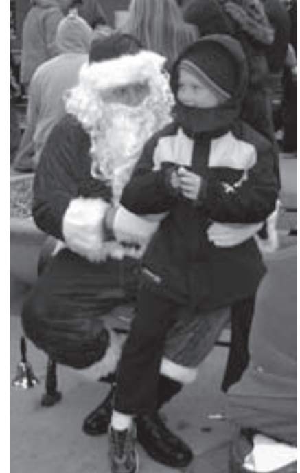
Yorkville residents braved the cold with smiles and good cheer at this year's Polar Express.