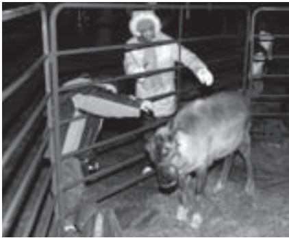
Kids got to pet reindeer and meet Mrs. Claus.

Kids also got a chance to see live reindeer and ice carving later that night. While the unexpectedly huge turnout made for a bit of a wait to see Santa , kids waited excitedly to get the chance to tell St. Nick what they wanted for Christmas.