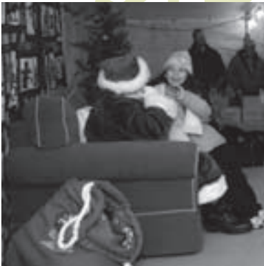
One little girl tells Santa what to bring for Christmas.