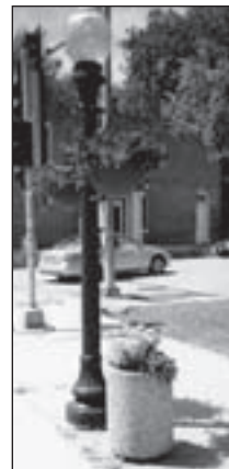
Yorkville's downtown benefits from new community project with the Yorkville Garden Club's new Hanging Basket program.