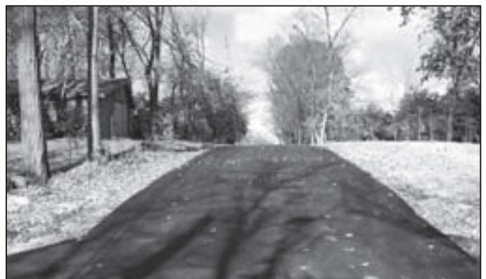
Top: Gawne Lane during construction.