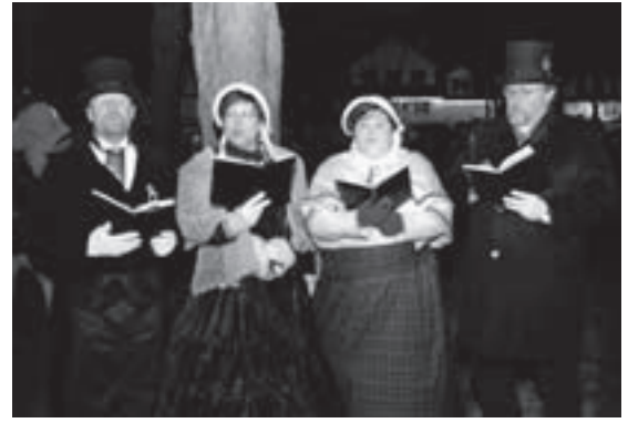
The Plano Victorian Lamplight singers wowed the crowd as they caroled through the park.

While the Yorkville Big Band rocked out in holiday style at Parkview Middle School , families rode on the carriage rides, took turns ice skating and warmed up in the heating tent all night long.