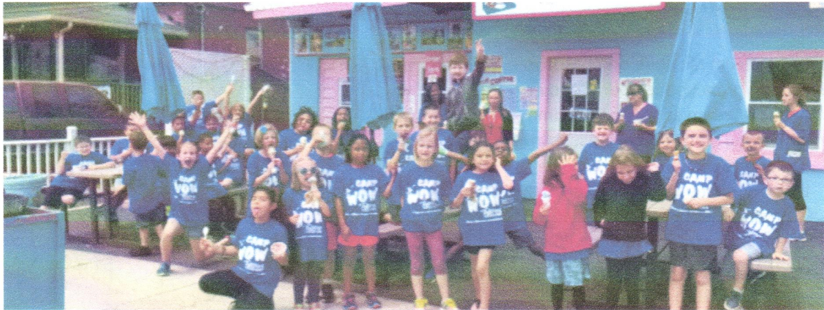
Foxy's Ice Cream, 2019