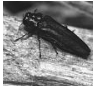
Metallic green, the Emerald Ash Borer was found within the City's limits in November