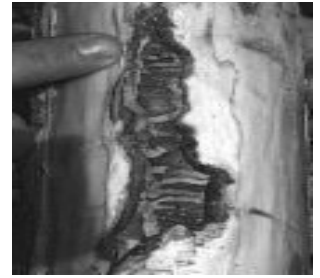
Heavy woodpecker damage on Ash trees (above) may be a sign of infestation.