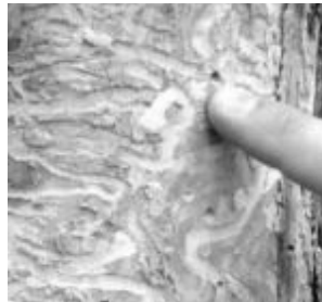
Adult EAB leave a D-shaped exit hole in the bark when they emerge in spring.

The Emerald Ash Borer (EAB) , a small, metallic green, non-native invasive pest was detected in the United City of Yorkville in late November. Also known in the scientific world as Agrilus Planipennis Fairmaire, the Emerald Ash Borer is an exotic beetle that was discovered in southeastern Michigan near Detroit in the summer of 2002. The adult beetles nibble on ash foliage but cause little damage. The larvae (infant stage) feed on the inner bark of ash trees, disrupting the tree's ability to transport water and nutrients. Ash trees can be infested with EAB for a few years before the tree begins to demonstrate any signs of EAB infestation. Symptoms of EAB include canopy dieback, D-shaped exit holes, shoots sprouting from the tree trunks and S-shaped larval gallerie underneath the bark.