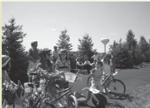
On your mark, get set go! Cyclists get ready to try the new bike trail linking the communities of Oswego and the United City of Yorkville.

The purpose of the Shared-Use Trail Plan is to establish Yorkville as a great place to ride your bike, jog, or walk by planning an extensive trail network throughout the Yorkville region. The Integrated Transportation Plan is also important to the revitalization of Yorkville's downtown area. A pedestrian friendly environment will not only rejuvenate the downtown area, but will create Yorkville