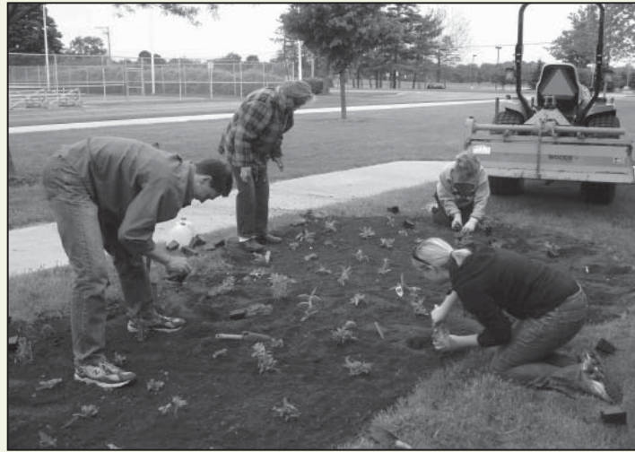
City Hall, 800 Game Farm Road, is sporting a new Rain Garden courtesy of the Green Committee and United City of Yorkville staff members.